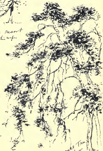
A Royal Tree in Windsor Great Park